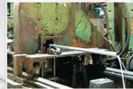
Steel Pipe Production