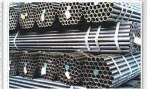
Loaded G.I Pipe